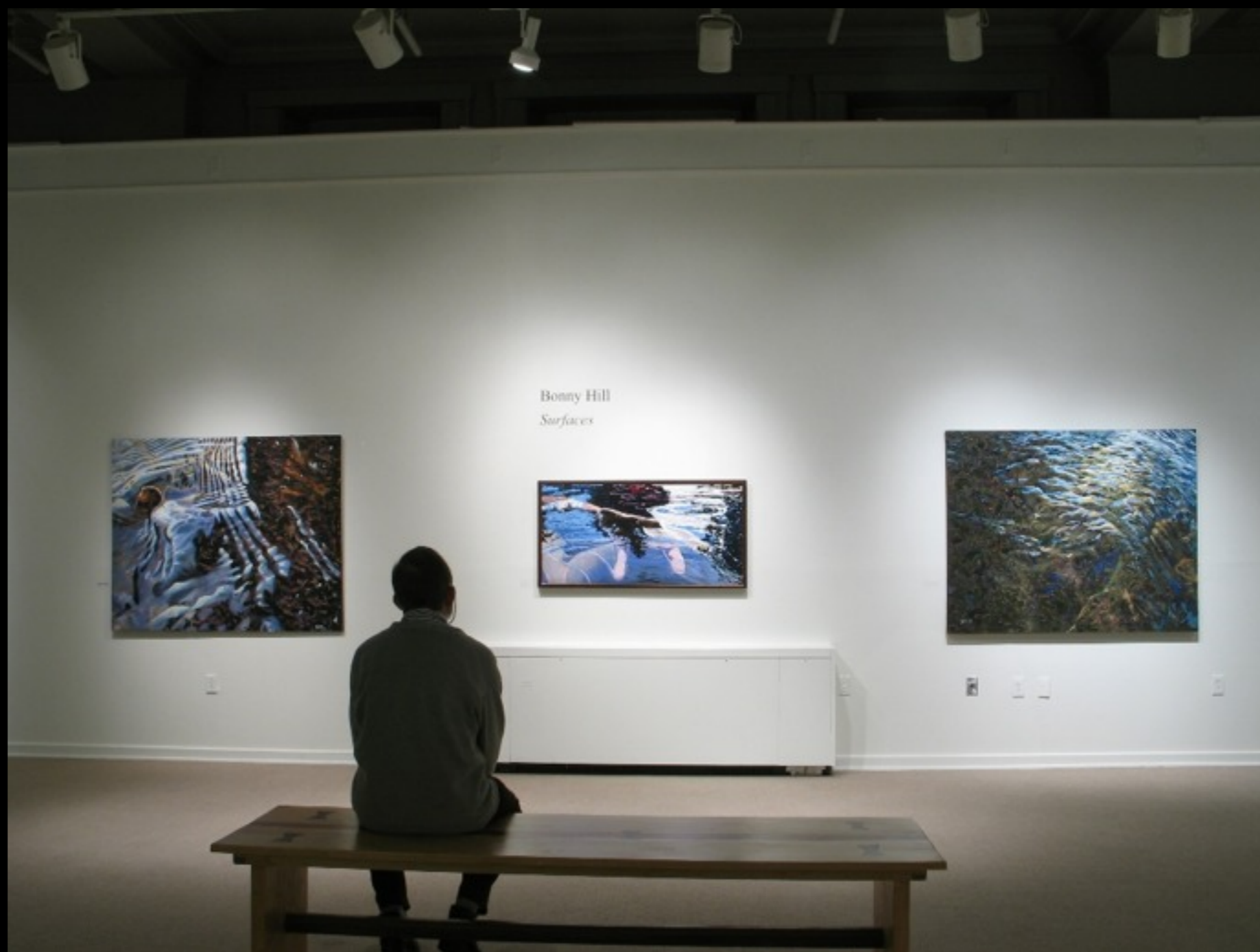
Bonny Hill Surfaces